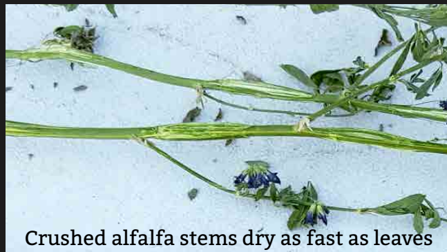
Crushed alfalfa stems dry as fast as leaves

NO Maintenance Metal Rollers NEVER need replacing Always set to the correct clearance end to end